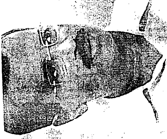
अरविंद केजरीवाल मुख्यमंत्री, दिल्ली

योजना की आरंभ तिथि : 01 दिसंबर 2018 आवेदन की अंतिम तिथि: 28 फरवरी 2019